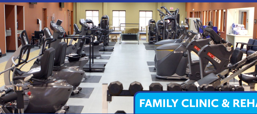
FAMILY CLINIC & REHAB/WELLNESS CENTER