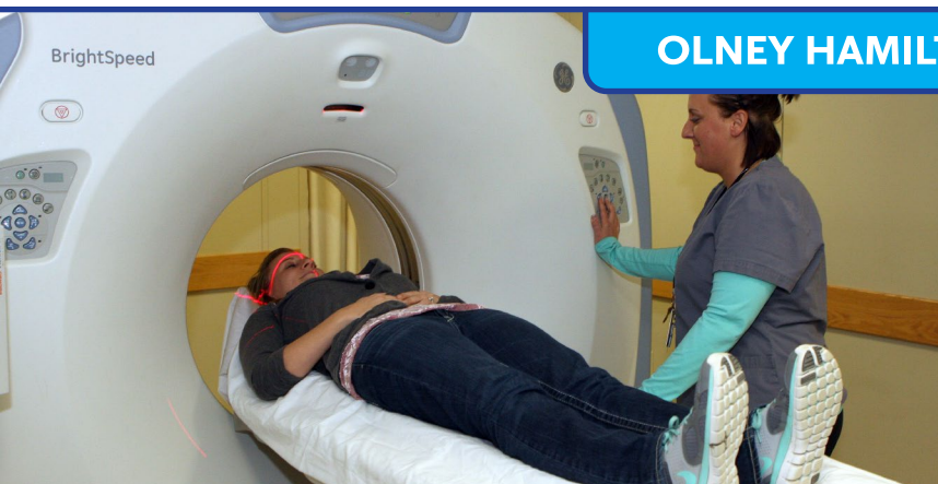
OLNEY HAMILTON HOSPITAL

Olney Hamilton Hospital is proud to offer a wide variety of services including: Emergency Care • Outpatient Services • Swing Bed Program • Obstetrics • Pastoral Services • Allergy Services • Olney Sleep Lab • EEG Testing